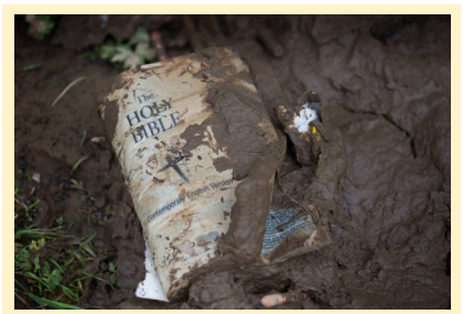
A Bible coated in mud lies outside Fenwick (W. Va.) United Methodist Church following heavy flooding.

God is the giver of good gifts and the things we use in our life of worship, prayer, study and service. These objects become bearers to us of God's word.