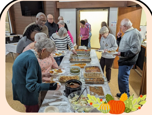
Everyone who attended the HARVEST DINNER enjoyed delicious food, fun and fellowship!

If you encounter any suspicious messages, we strongly advise deleting them immediately.