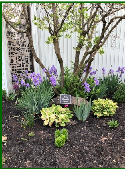
Ryder Memorial Garden in Bloom!