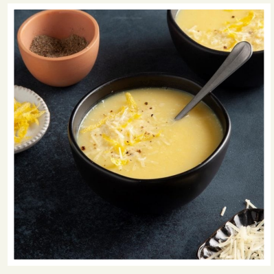
Recipe courtesy of "Taste of Home"